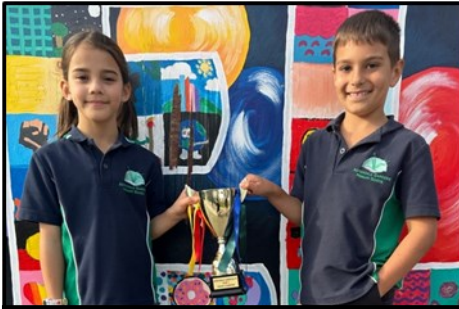
Year 3 - 3KA

Congratulations to the following class and Houses who finished Term 1 at the top of the ladder for