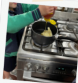
Rice Bubble Bars

Cooking fosters children's critical thinking, problem-solving abilities, and creativity. It also gives children the chance to apply their knowledge by counting, measuring, following a sequence and following directions.