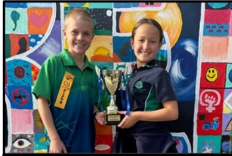
Year 4 - Falcons