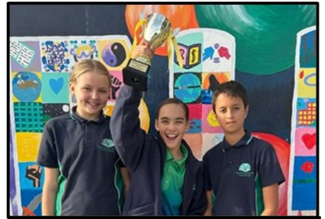
Year 5 - Owls

Throughout Term 2, students will be participating in modified games of AFL and Basketball , aiming to finish at the top of their respective ladders to win the Year Level Sport trophies for Term 2. Good luck to all Houses!